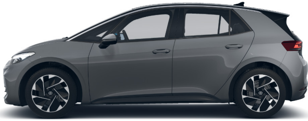
Moonstone Grey Solid