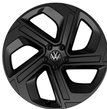
OPTIONAL ON ID.3 GTX PERFORMANCE PLUS 20" 'Skagen' alloy wheels in black 8J x 20 Tyres: 215/45 R20 8J x 20 Tyres: 235/40 R20 1