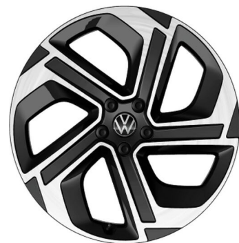
STANDARD ON ID.3 GTX MODELS 20" 'Skagen' alloy wheels 8J x 20 Tyres: 215/40 R20 8J x 20 Tyres: 235/40 R20 1