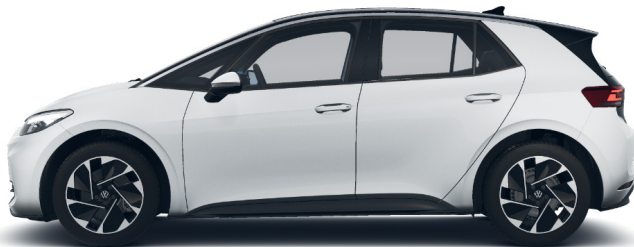
Glacier White Metallic