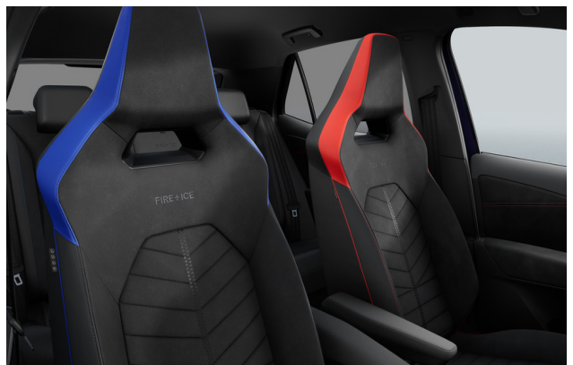
GTX ArtVelour Top Sport seats Soul-Artvelour Eco Standard on ID.3 GTX FIRE+ICE Models

Note: Some parts of leather interior trim will contain artificial leather Note: The print processes do not allow exact reproduction of the upholstery & insert colours.