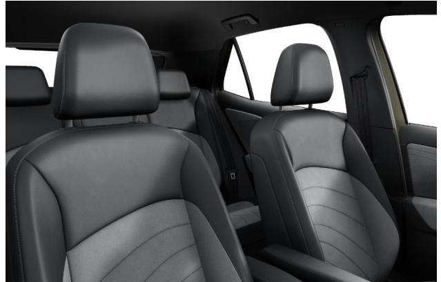
ArtVelour Seats Dusty Grey/Dark Soul Black Standard on ID.3 Pro S Models Optional on ID.3 Pro Models with Interior Package