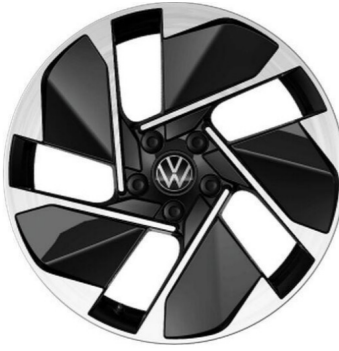
STANDARD ON ID.3 PURE PLUS & PRO PLUS OPTIONAL ON ID.3 PURE & PRO 18" 'East Derry' alloy wheels 7.5J x 18 Tyres: 215/55 R18