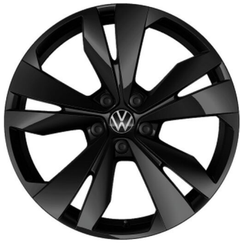
OPTIONAL ON ID.3 PURE & PRO MODELS 19" 'Bergen' alloy wheels 7.5J x 19 Tyres: 215/50 R19