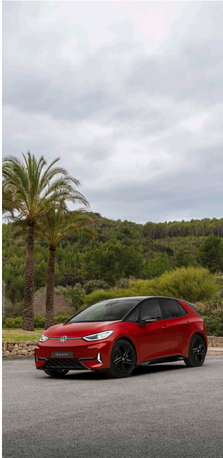
Note: The above images show ID.3 GTX Performance Plus with 20" 'Skagen' alloy wheels in black