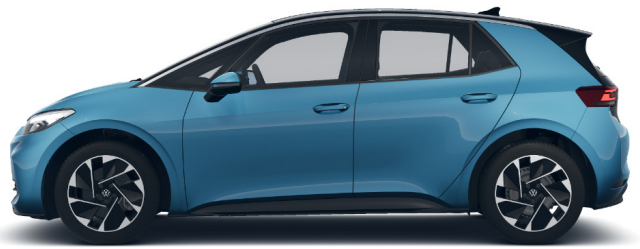
Costa Azul Metallic 1