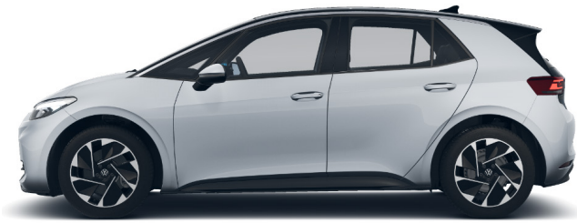
Scale Silver Metallic