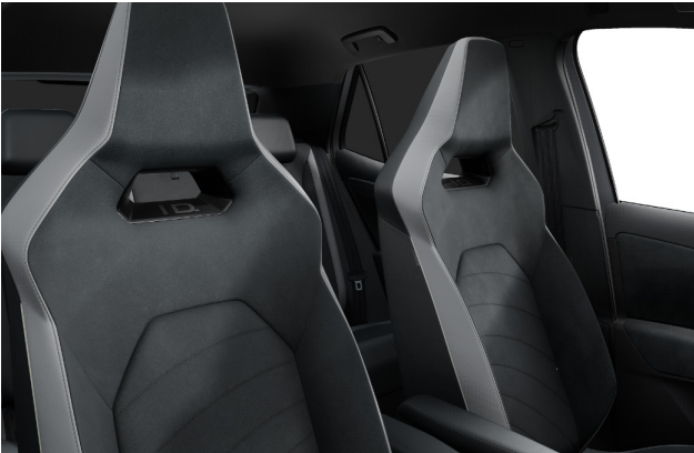
ArtVelour Top Sport seats Soul-Artvelour Eco Optional on ID.3 Pro & Pro S Models with Interior Package Plus