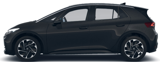
Grenadill Black Metallic