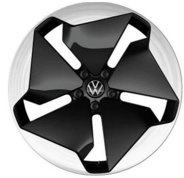
STANDARD ON ID.3 PRO S MODELS OPTIONAL ON ID.3 PRO MODELS 20" 'Sanya' alloy wheels 7.5J x 20 Tyres: 215/45 R20