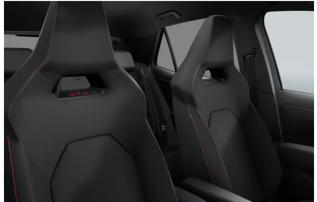
"GTX" Fabric sport seats Soul Black Standard on ID.3 GTX