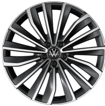
OPTIONAL ON ID.3 PURE & PRO MODELS 20" 'Trondheim' alloy wheels 7.5J x 20 Tyres: 215/45 R20