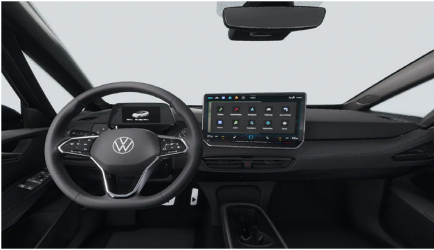
Standard on ID.3 Pure & Pro Models Soul/ Crystal Grey stitching