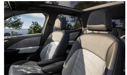
Note: The above image shows ID.3 Pro S with optional panoramic sunroof