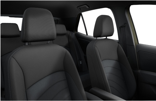
"Taia" Fabric seats Grey-Melange Taia/Soul Black Standard on ID.3 Pure & Pro Models