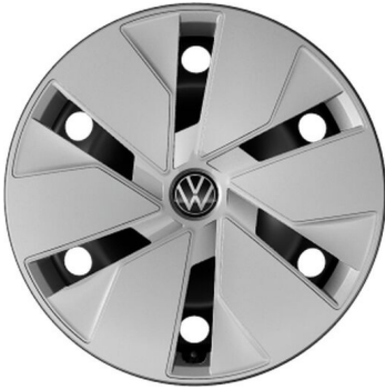
STANDARD ON ID.3 PURE & PRO 18" steel wheels 8.5J x 18 Tyres: 215/55 R18