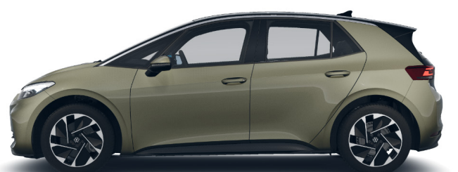
Dark Olivine Green Metallic 1