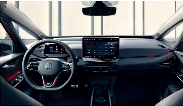
Standard on ID.3 GTX Models Soul / Red stitching