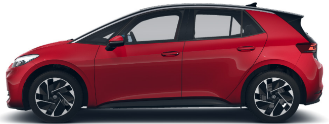
Kings Red Metallic