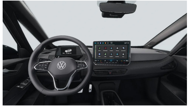
Standard on ID.3 Pro S Models Optional on ID.3 Pro Models with Interior Packages Dusty Grey Dark / Crystal Grey stitching