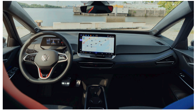
Standard on ID.3 GTX FIRE+ICE Models Soul / Red & Blue stitching

Note: Some parts of leather interior trim will contain artificial leather Note: The print processes do not allow exact reproduction of the upholstery & insert colours.