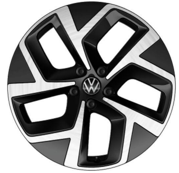
OPTIONAL ON ID.3 PURE & PRO MODELS 19" 'Wellington' alloy wheels 7.5J x 19 Tyres: 215/50 R19